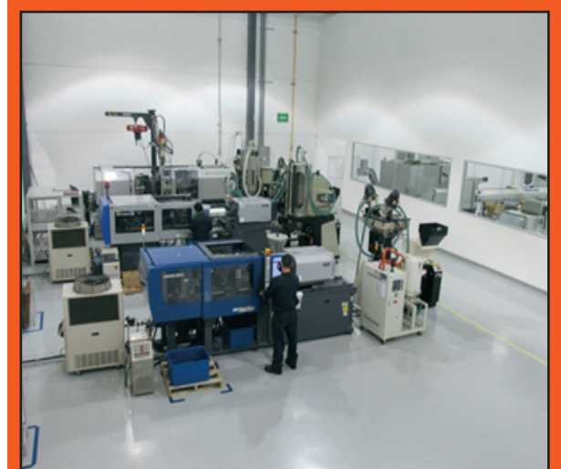
Molex tested Dyna-Purge® D2 in their state-of-the-art equipment and it reduced machine downtime by more than 50% as a result.

SHUMAN Dyna-Purge® Discover the Difference®